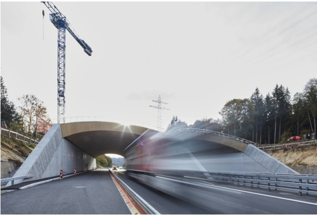
Assembly work during the day