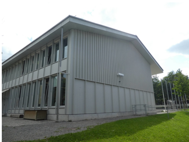
Facade view north