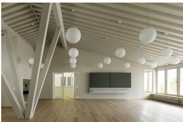
Schoolroom ground floor