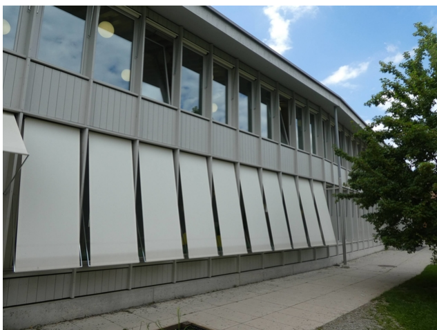
Facade view east