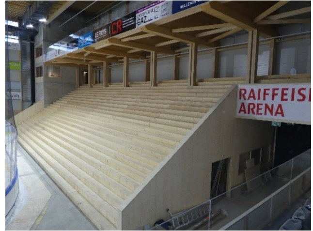
...and processed into building products