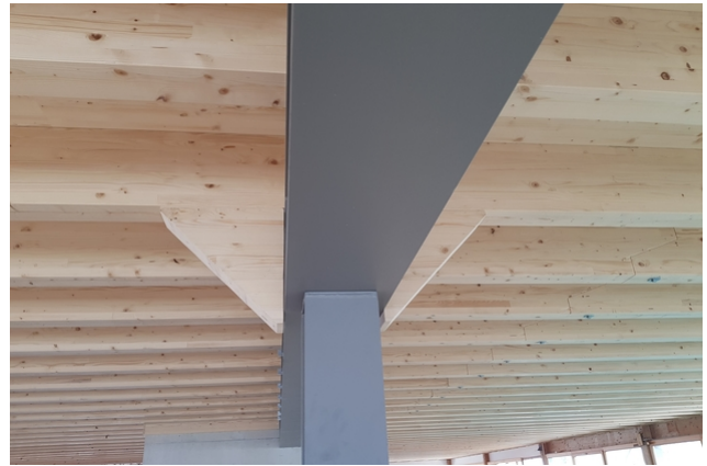
Combination of steel structure and wood construction