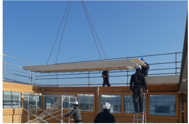
Installation of a roofing element