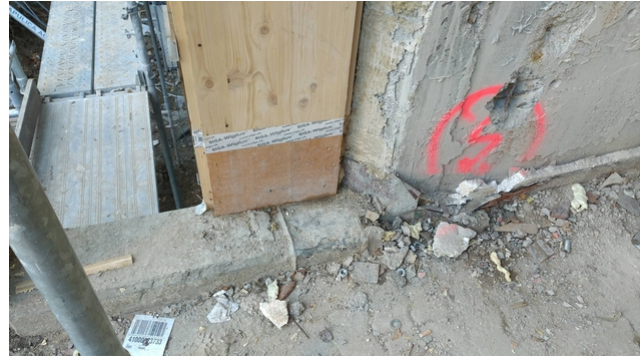
Connection of the wooden structure to the existing concrete elements