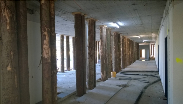
Temporary support with tree trunks