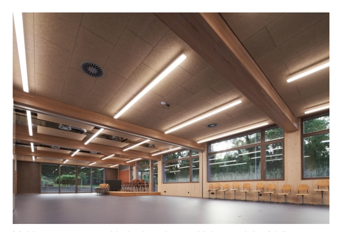
Multipurpose room with the beech wood joists and the folding partitions