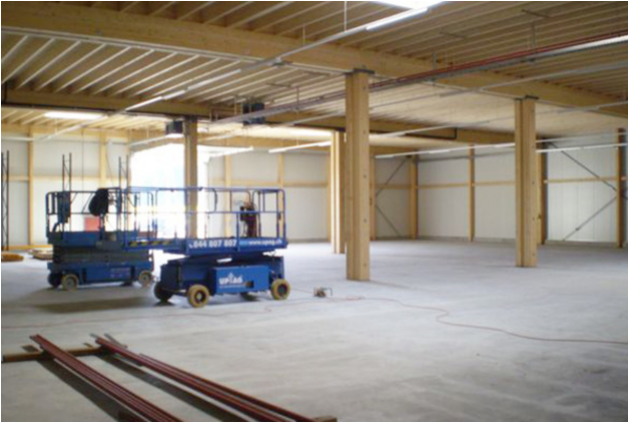
Interior view carcass