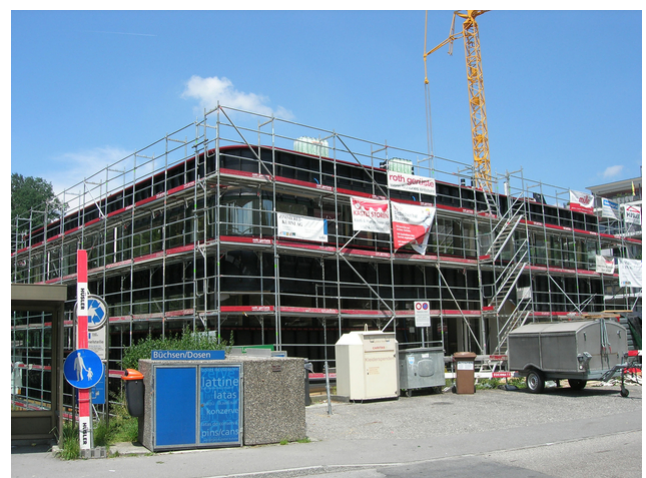
Exterior view from Büttenbergstrasse