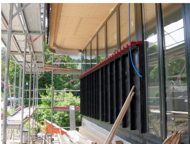
Overhanging floor slab in the area of the entrance