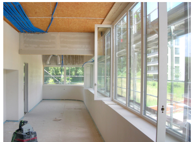
Work niche with cantilevered BSH beam

In order to design the large cantilevers and distribute the forces to the pile foundations, high beams made of glulam were inserted in the roof as well as in the floor slabs. Another highlight were the round skylights: due to the filigree support in four points, the skylight roof seems to float on the surrounding light band.