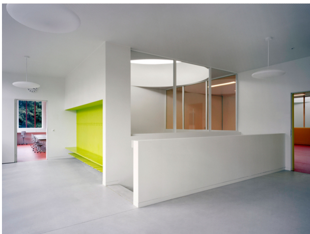
Interior view; Photo: Roger Frei, Zurich

The affected residents of the neighborhood successfully resisted and convinced the parliament to erect a new school building. The new school building was to be built of wooden elements, and its architectural design was to give it a light, attractive appearance. With the idea of building the schoolhouse closer to the street, a large break area with a lot of green space was created. To ensure that the new building is also in harmony with the green surroundings, the school building was built according to the Minergie-ECO standard. The building consists of a basement in solid construction and two upper floors in wooden element construction. The generously designed, bright classrooms placed high demands on the structural concept.