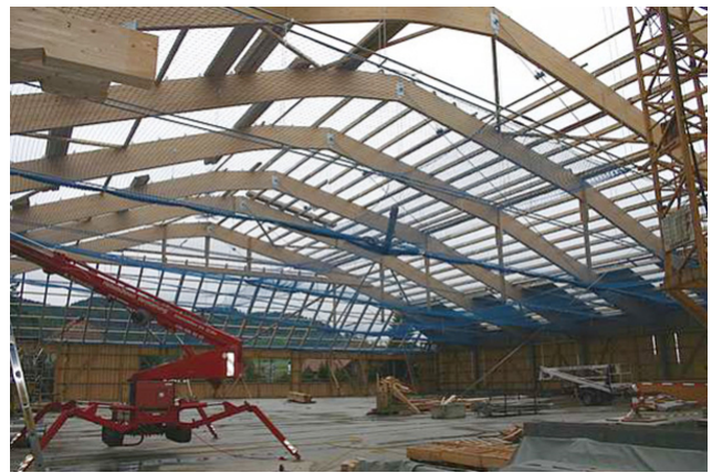
Setting up the binder