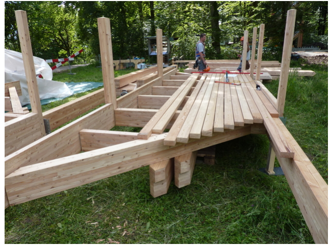
Assembling the tower