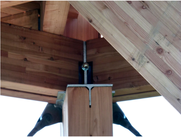
Support platform 2