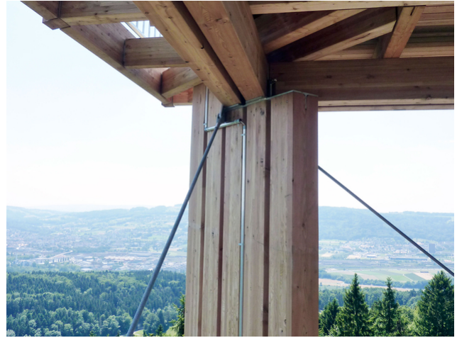
Support platform 1