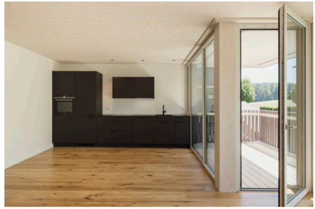
TS3 assembly in its finished state