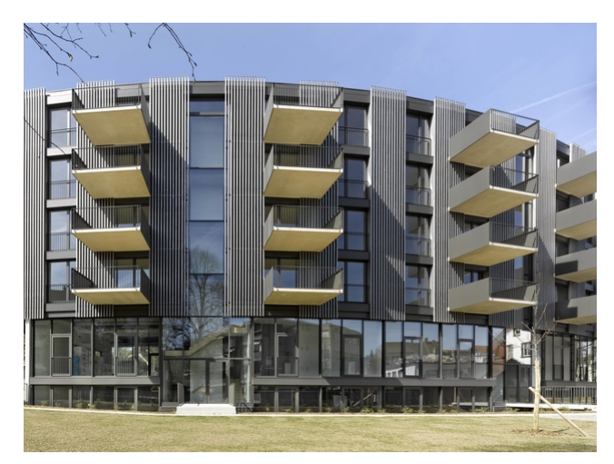
Facade view with balconies