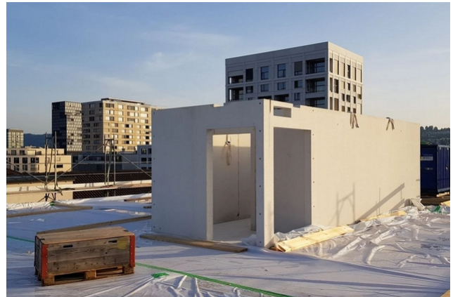
Stairwell during construction