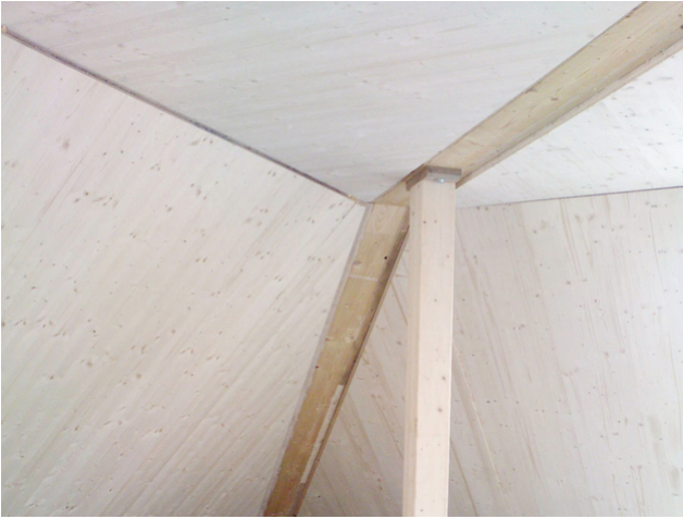
Interior view ridge