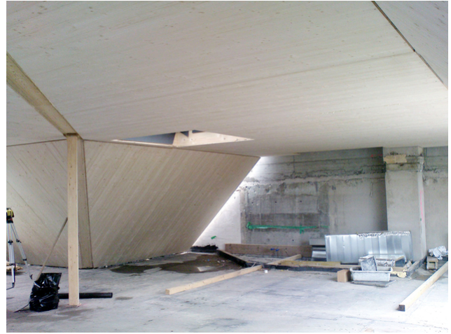
Interior view throat