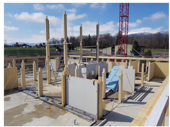
First floor under construction.