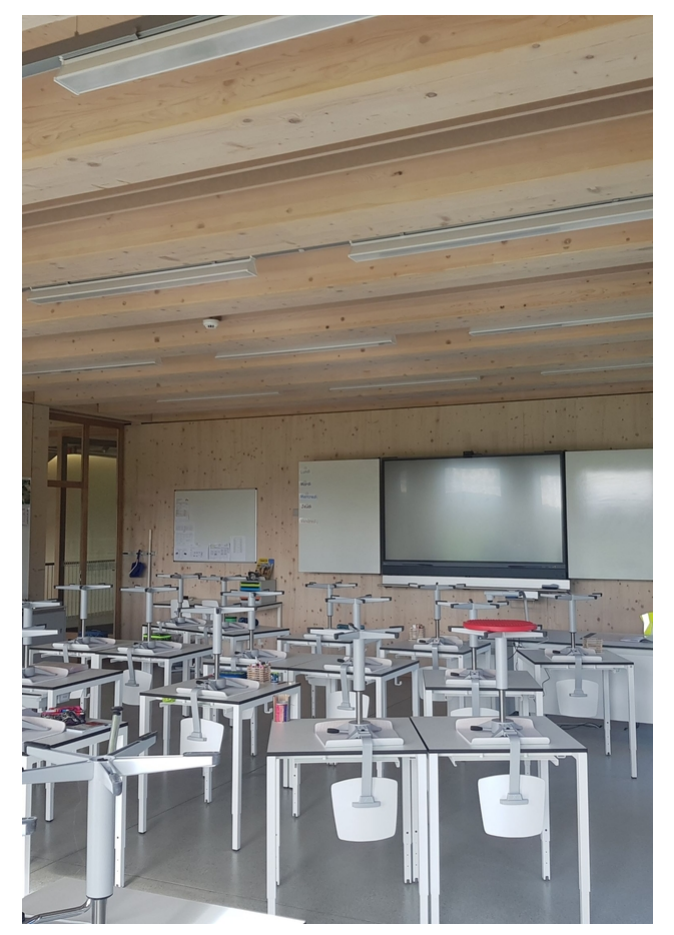
Interior of a classroom.