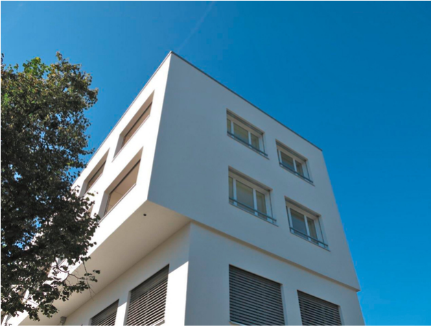
The striking overhang emphasizes the boundary between old and new