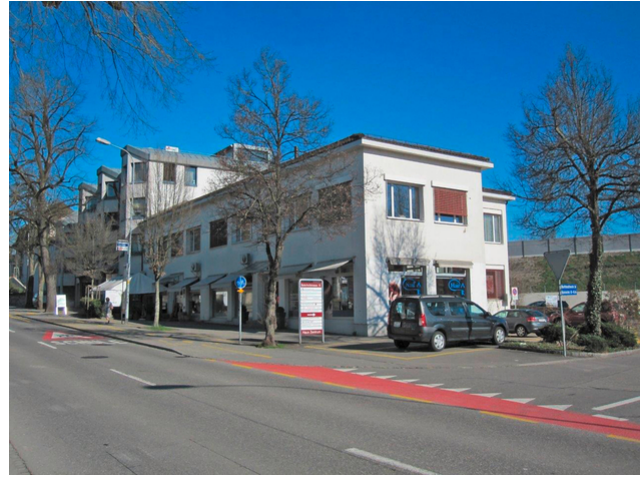
The commercial building before the extension