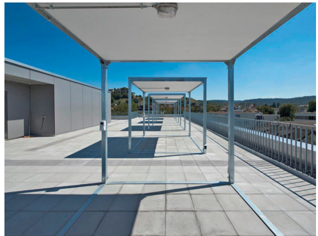
Spacious roof terrace with view of Lenzburg