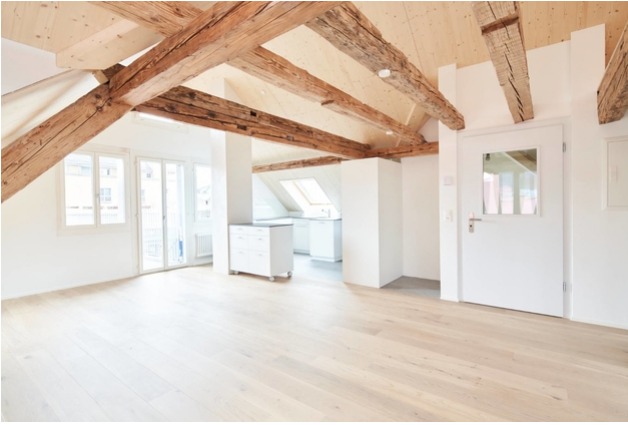
Room with kitchen