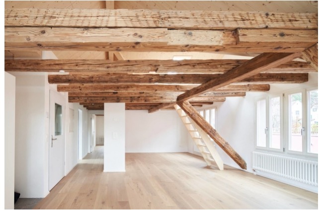
Room (with ascent)