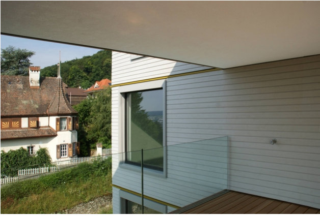
The terrace