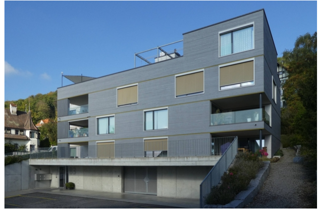
View after 6 years